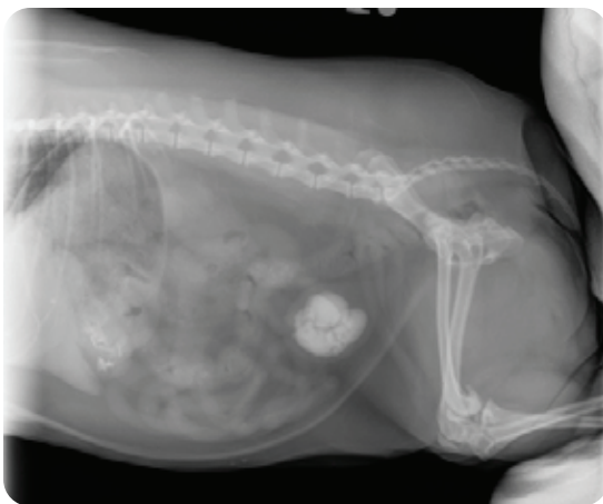
"Knopa" Pre-surgical radiographs

After meeting with the Vet Advisory Committee and getting your feedback, we have made some changes to our program for the coming year. We are simplifying the process and making it easier for you to access the funds. Please watch for updates before the end of the enrollment period and at the start of FYE24. We will keep you posted. We want to make it as easy as possible for all of you to use every penny of your funds every year.